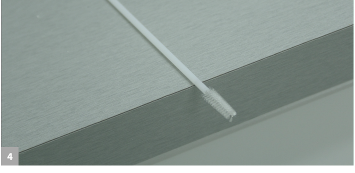
Allow the swab to air dry for 5 minutes. Do not allow bristles to touch any other surface. Return the swab (bristles first) into the original swab sleeve. The end of the paper sleeve can remain unsealed. If the opening in the swab sleeve is greater than 1 inch, tape the edges of the sleeve to protect the swab. Swab sleeves can be placed in an envelope with submission form to return to the lab.