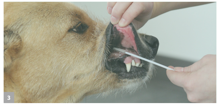
Lift the lip and place the bristles between the gum and cheek. Allow the lip to fall and place firm pressure on the outside of the muzzle while rolling the bristles between the cheek and gum for 15 seconds.

Pull back the loose ends of the swab sleeve about 1 inch (do not tear) open the swab sleeve completely). Use the plastic handle to pull swab out of packaging.