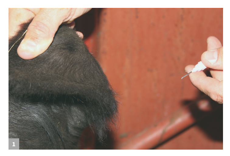
Appropriately restrain the animal. Locate a blood vessel, visually or by feel. Clean the area so the sample is not contaminated with dirt or manure. Use a clean needle or lancet for every animal.