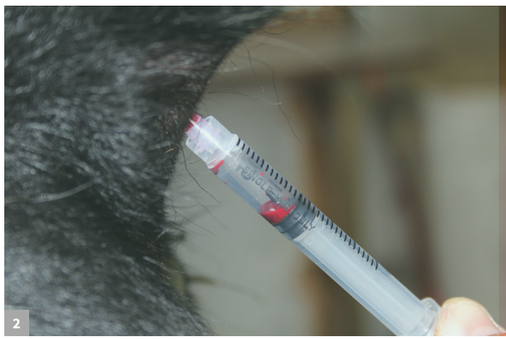
Blood can also be sampled with a syringe or blood tube from the vein on the underside of the tail. This may be easier than sampling blood from an ear vein that is covered with long, thick hair.