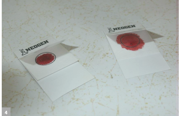
Before placing blood drops on blood cards, write an accurate name and animal ID in the spaces provided. Let the cards sit open and air dry before closing cover flap. If blood is sticky and gets on the top of the card, the sample is not useful.