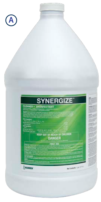
433600/1 - 1 gal