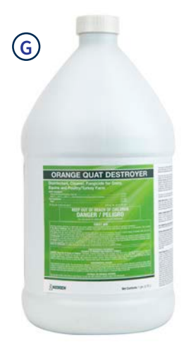
403357/1 - 1 gal