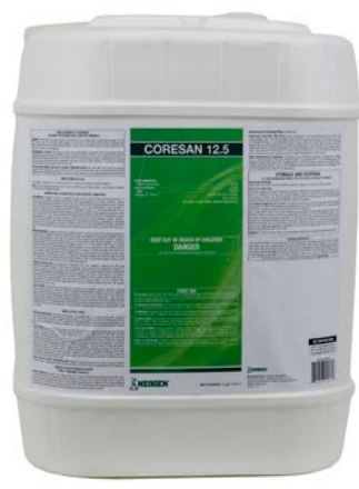
650410/5 - 5 gal