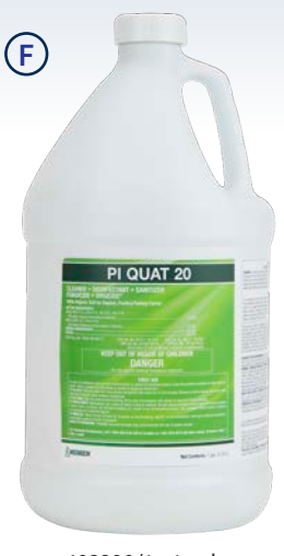
403290/1 - 1 gal