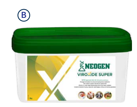
433608/11 - 11 lb