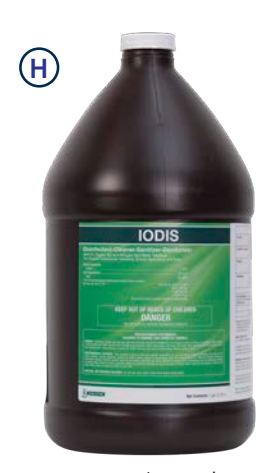
433300/1 - 1 gal