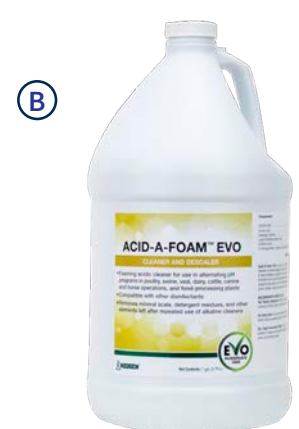
418086/1 - 1 gal