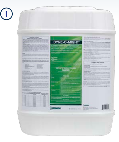
404184/5 - 5 gal