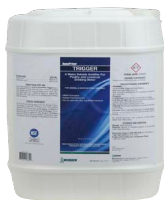
488018/5 - 5 gal