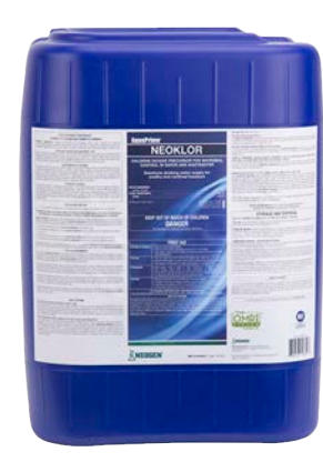
480015/5 - 5 gal